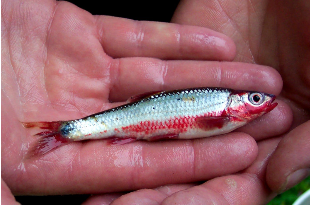
Figure 1. Male cardinal shiner ( Luxilus cardinalis ) in breeding coloration.

Arkansas, Missouri, and Oklahoma, the striped shiner ( Luxilus chrysocephalus ) species group is an example of glacial relict populations that formed unique species from a widely distributed common ancestor (Mayden 1988a). One of these species, the cardinal shiner ( Luxilus cardinalis ; Fig. 1), inhabits portions of the Arkansas and Red river basins in Arkansas, Kansas, Missouri, and Oklahoma (Mayden 1988b). In southeastern Kansas, a relict population exists in the upper Neosho River basin and is now isolated completely because of construction of John Redmond Reservoir (completed in 1964; Fig. 2). Occasional collections have also been taken from the upper Verdigris River basin of Kansas (Cross 1967; Mayden 1988b). Whereas some aspects of cardinal shiner ecology have been studied since its description, especially in portions of Oklahoma (e.g., McNeely 1987), little is known about the life history and feeding ecology of the relict population in the upper Neosho River drainage of Kansas (Cross and Collins 1995).